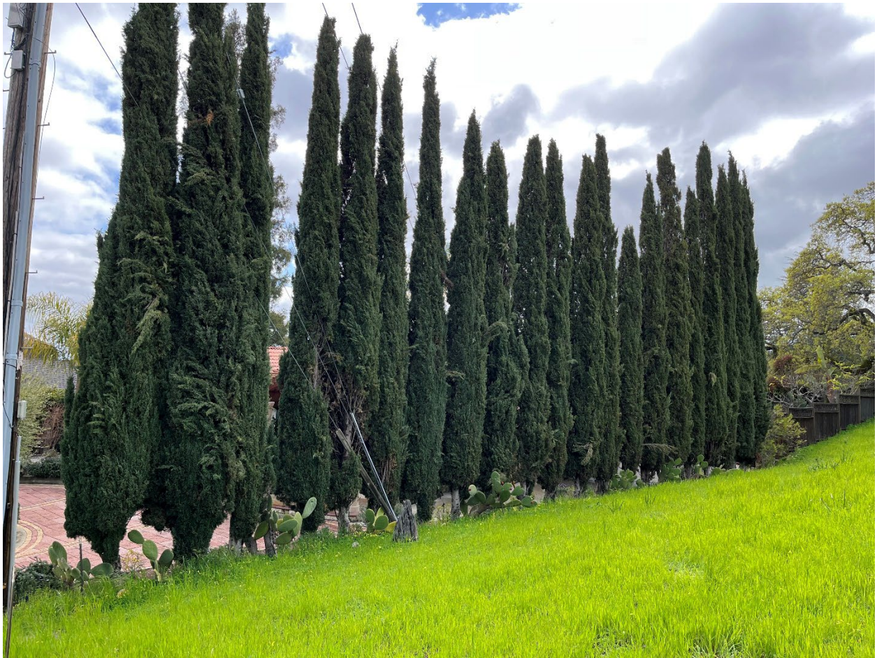
Tree #s 4