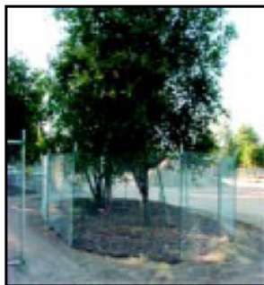
IMAGE 2.15-1 Tree Protection Fence at the Dripline

Tree # 3: TPZ should be at 20 feet from the trunk in accordance with Type I Tree Protection as outlined and illustrated in image 2.15-1 and 2 (6) .