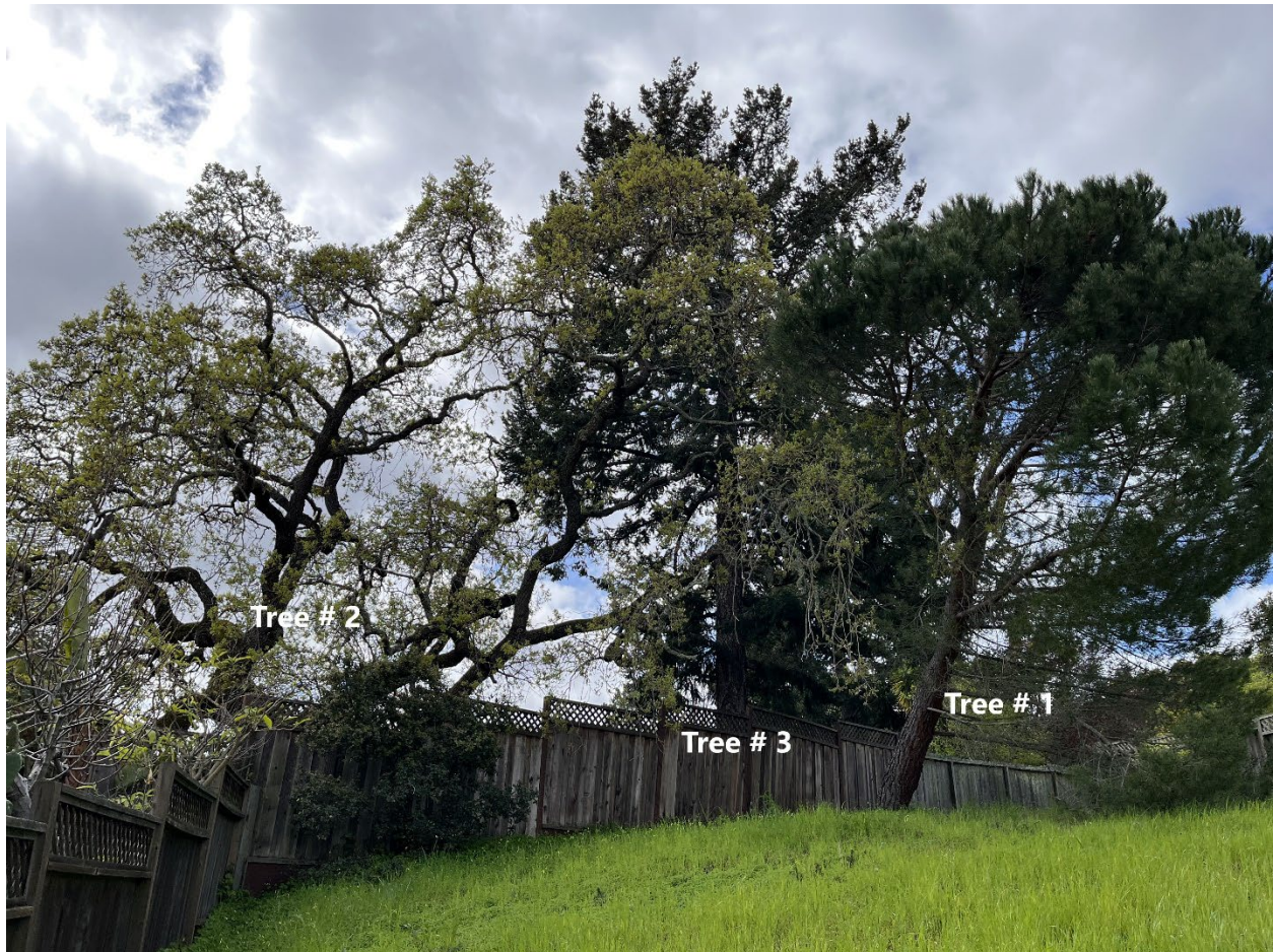
Tree #s 1, 2 and 3