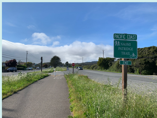
Example of a multimodal trail