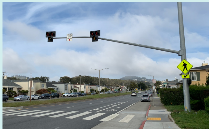
Street crossing with striping and beacons